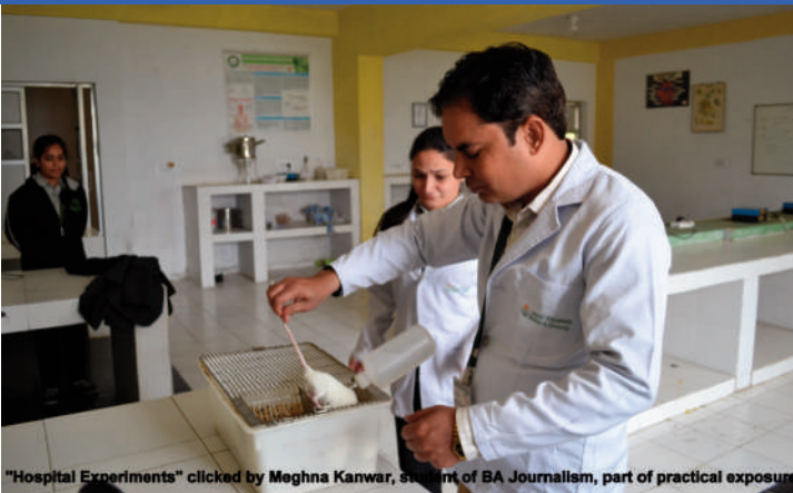
"Hospital Experiments" clicked by Meghna Kanwar, student of BA Journalism, part of practical exposure